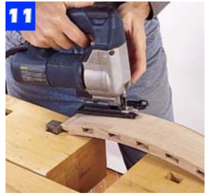
Use a template to lay out the arched profile of the upper back rail. Then, cut to the line with a sabre saw and smooth.

Mark the shoulders on the top and bottom edges of the curved back rails and use a small backsaw to make the cuts (Photo 12). First, make the cuts into the endgrain of the tenon. Then finish the shoulder by cutting across the grain.