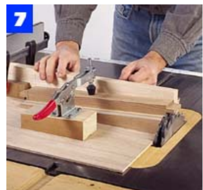
When cutting the opposite tenon faces on the rails, reverse the ramp on the jig and readjust the dado blade height.