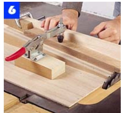
To cut the angled tenons on the side rails, support the stock in a table saw jig that holds the work at a 4° angle.

Install a 5/16-in.-dia. bit in the drill press and bore slightly overlapping holes to remove most of the waste from the mortises in both the curved and straight rails (Photo 9). Then, use a sharp chisel to pare the walls and square the ends of the mortises (Photo 10). Test a slat in each mortise--the fit should be snug. Make another template for the arched shape of the top back rail and use the template to trace the shape onto the workpiece. Use a sabre saw to cut the profile (Photo 11).