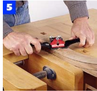
Use a spokeshave to smooth the inside curve of the back rail, and then cut and smooth the outer curve.

Cut one surface of each tenon with the ramp angled down toward the dado blade (Photo 6). Then, secure the ramp in the opposite direction and readjust the blade height for the opposite side of each tenon (Photo 7). If you're using the holddown clamp, you'll need to remount it. Then, use the miter gauge without the jig to make the angled cuts for the top and bottom shoulders of the side rails (Photo 8). Cut strips for the side and back slats. Crosscut the slats to finished length, and set them aside.