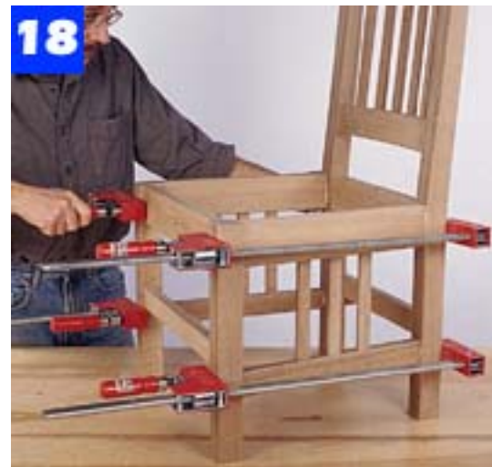
Join the back subassembly to the front-leg/side-rail assembly. Work on a flat surface so the legs remain even.

Finally, attach the finished slip seats to the frames with screws installed through the corner blocks into the underside of each seat.