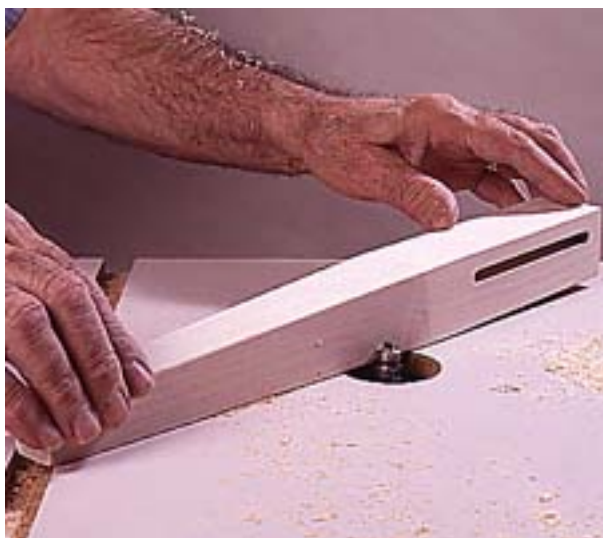
6--Round the bottom of the leg corners on the router table. Don't round the top of the leg where it abuts the apron.

Once the hinge is installed, mark and bore the screw pilot holes for lid supports. Attach the supports to the aprons first,