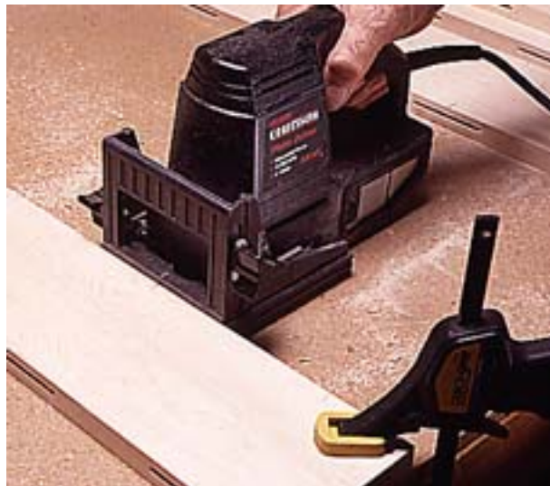
1--Joint the edges of the boards for the tabletop and cut the slots in them to receive the joining plates.

Apply glue to the edges and plates, slide the boards together, then apply pressure to the cauls and the long clamps (Photo 3).