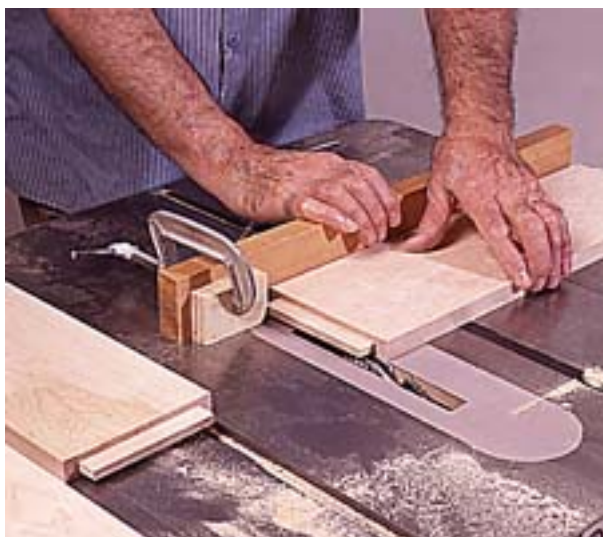
7--Use a stopblock clamped to the miter gauge and a dado blade in the table saw to cut the apron tenons.