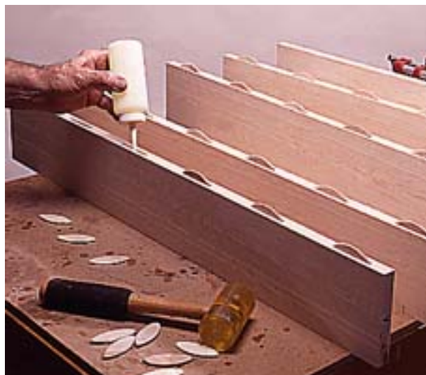
2--Save glue application time by pregluing